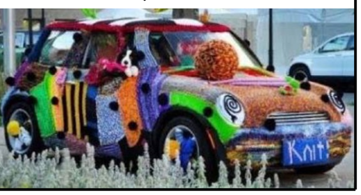
This guy is serious about his knitting...

<u>Below</u>: when you end up with lots of scraps and too much time on your hands: